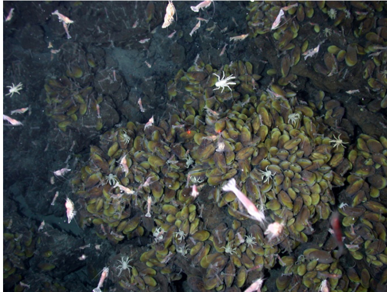
Figure 46.9 Swimming shrimp, a few squat lobsters, and hundreds of vent mussels are seen at a hydrothermal vent at the bottom of the ocean. As no sunlight penetrates to this depth, the ecosystem is supported by chemoautotrophic bacteria and organic material that sinks from the ocean's surface. This picture was taken in 2006 at the submerged NW Eifuku volcano off the coast of Japan by the National Oceanic and Atmospheric Administration (NOAA). The summit of this highly active volcano lies 1535 m below the surface.

Chemoautotrophs are primarily bacteria that are found in rare ecosystems where sunlight is not available, such as in those associated with dark caves or hydrothermal vents at the bottom of the ocean ( Figure 46.9 ). Many chemoautotrophs in hydrothermal vents use hydrogen sulfide ( \text{H}_2\text{S} ), which is released from the vents as a source of chemical energy. This allows chemoautotrophs to synthesize complex organic molecules, such as glucose, for their own energy and in turn supplies energy to the rest of the ecosystem.